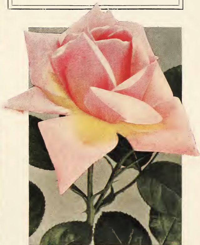
Alida Lovett. A climbing variety